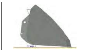
3° angle between the bucket's bottom line & the bolted cutting edge for more longevity

* Italy only- bucket compliant with Italian road regulations